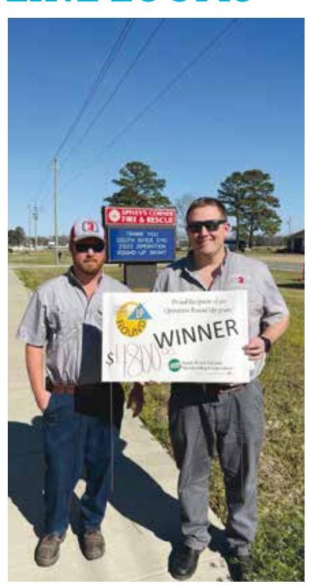
Spivey's Corner Volunteer Fire & Rescue

To speak with someone about Operation Round Up, call 910.892.8071 or email sremc@ sremc.com.