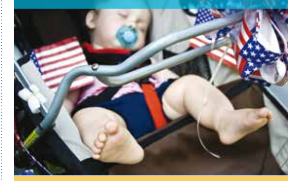
South River EMC offices will be closed Monday, July 5, in celebration of Independence Day.